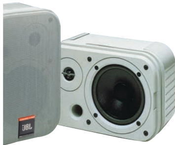
CONTROL 1 PRO-WH