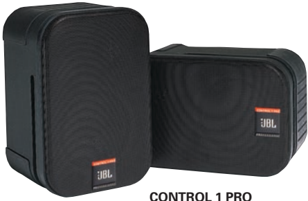
CONTROL 1 PRO

The JBL Control Series speakers offer well balanced sound and exceptional power handling, making these speakers ideal for any installation requiring professional control monitor performance from a compact source.