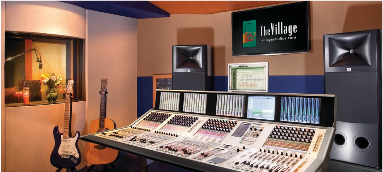
M2 Master Reference Monitors at The Village Studios, Los Angeles, CA