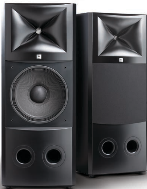
M2 (shown with removable grille)

Until now, the impressive large-format monitoring experience has been unattainable in small and medium-size rooms. With the introduction of the M2 Master Reference Monitor, JBL brings world-class large-format monitoring to a broad range of production spaces. Leveraging a new generation of high-output, ultra-low distortion JBL transducers, the M2 provides an in-room response of 20 Hz to 40 kHz, with the high SPL and dynamic range required for demanding music and film production. The M2's revolutionary Image Control waveguide ensures stunning imaging across a wide listening area. With a footprint of only 14 inches deep and 20 inches wide, the M2 two-way system outperforms many larger and more costly 3-way and 4-way systems, making big, detailed sound an option for artist studios, mastering facilities, small mix stages and screening rooms.